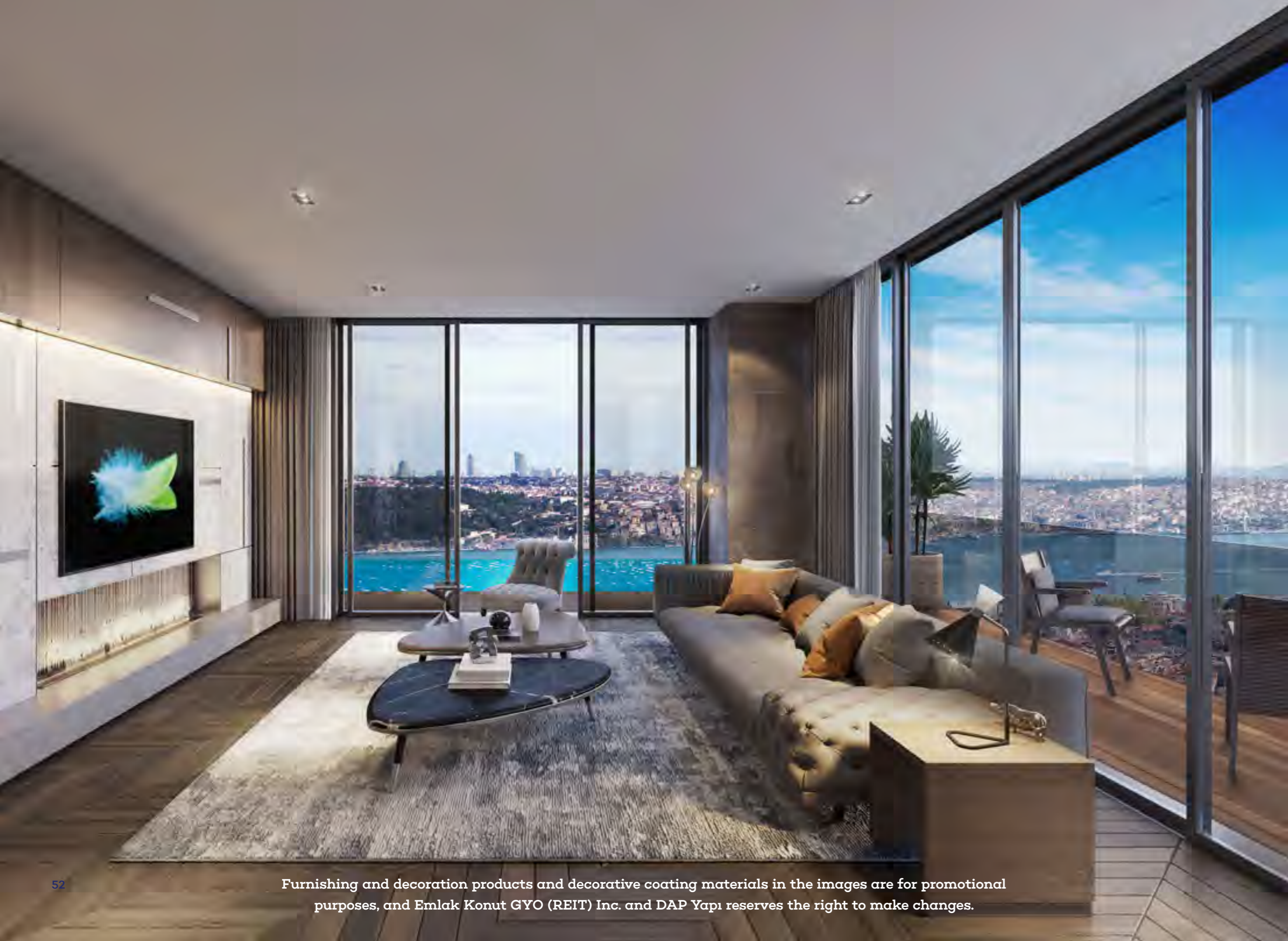
Furnishing and decoration products and decorative coating materials in the images are for promotional purposes, and Emlak Konut GYO (REIT) Inc. and DAP Yapı reserves the right to make changes.