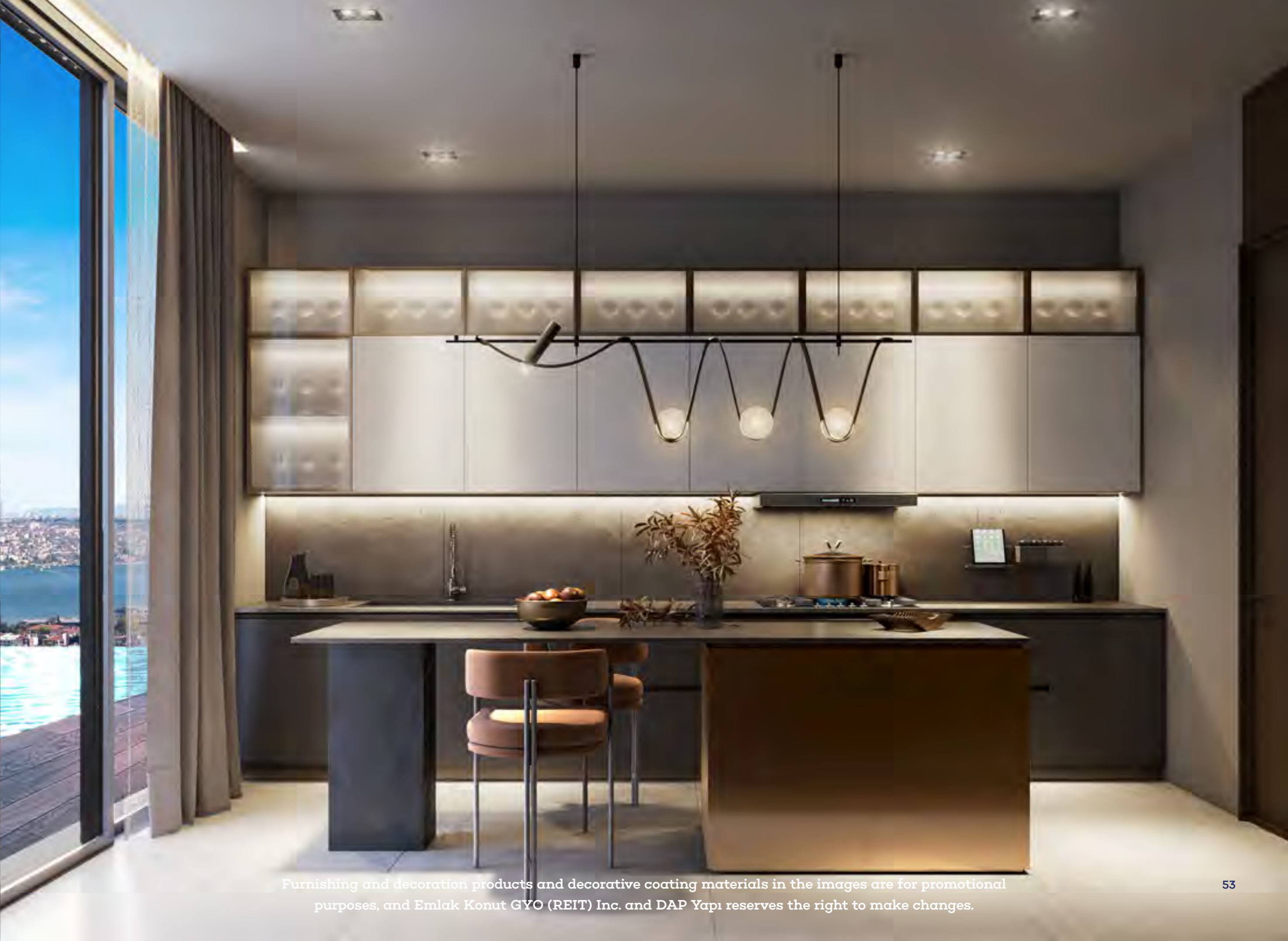
Furnishing and decoration products and decorative coating materials in the images are for promotional purposes, and Emlak Konut GYO (REIT) Inc. and DAP Yapı reserves the right to make changes.