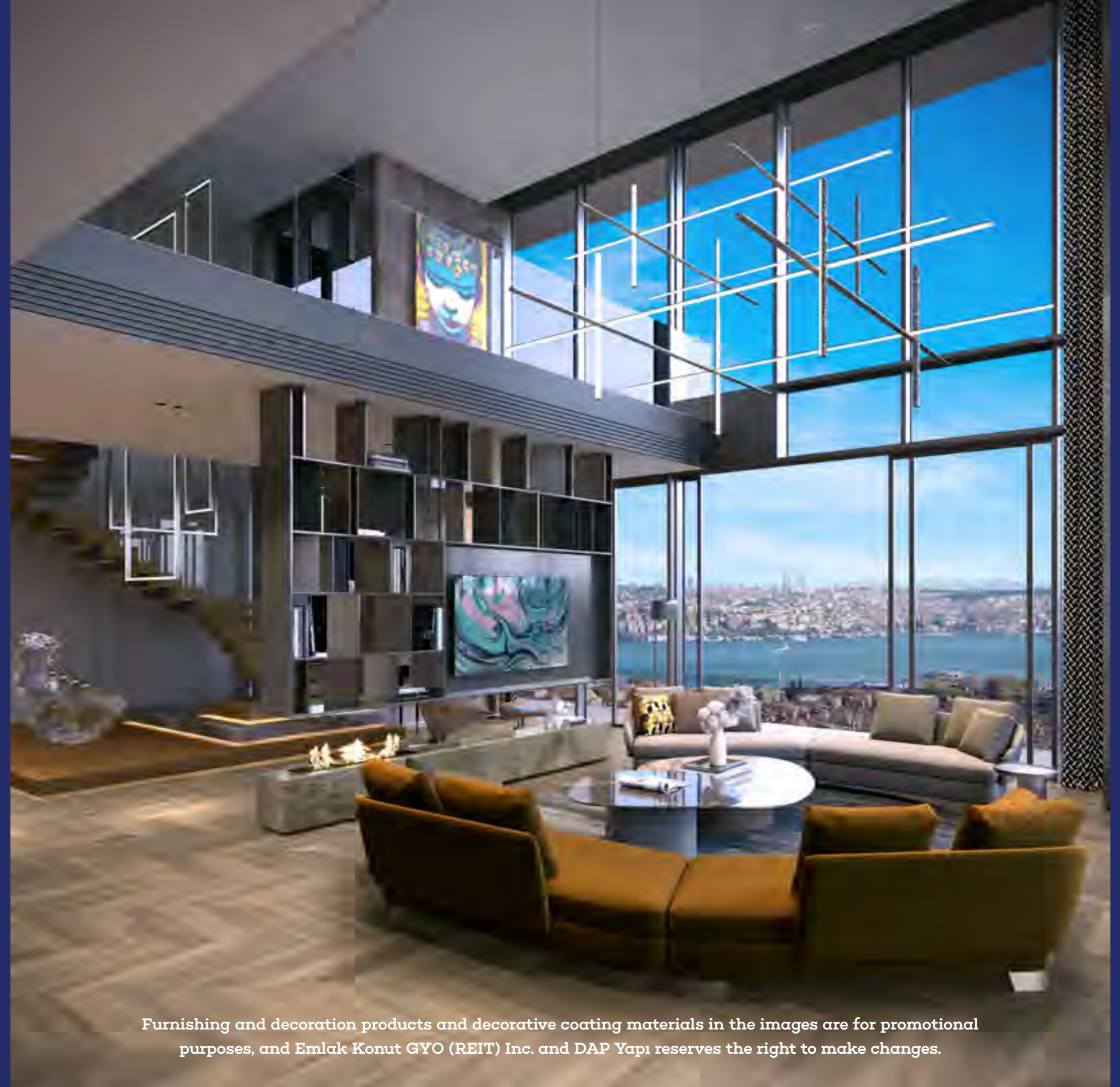
Furnishing and decoration products and decorative coating materials in the images are for promotional purposes, and Emlak Konut GYO (REIT) Inc. and DAP Yapı reserves the right to make changes.