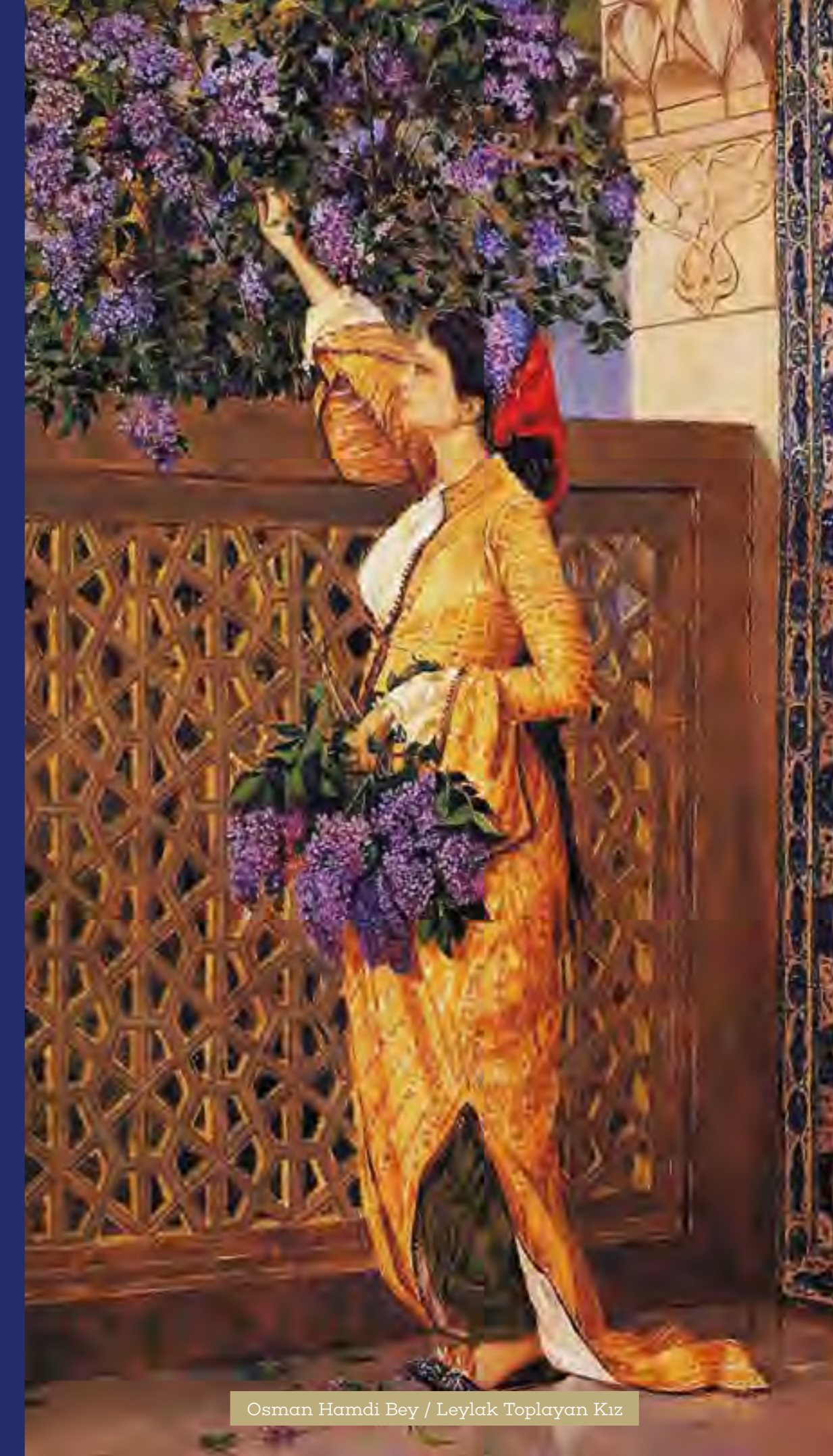
Osman Hamdi Bey / Leylak Toplayan Kız

A luxurious home is a home that can be handed down from father to son like a collection, and a legacy that adds value to the city where it is located.