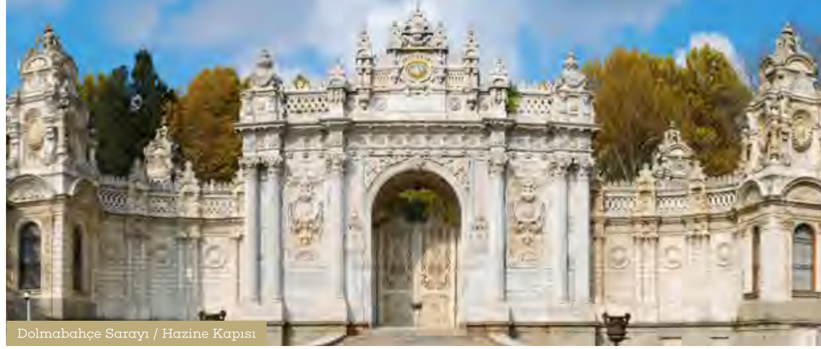
Dolmabahçe Sarayı / Hazine Kapısı