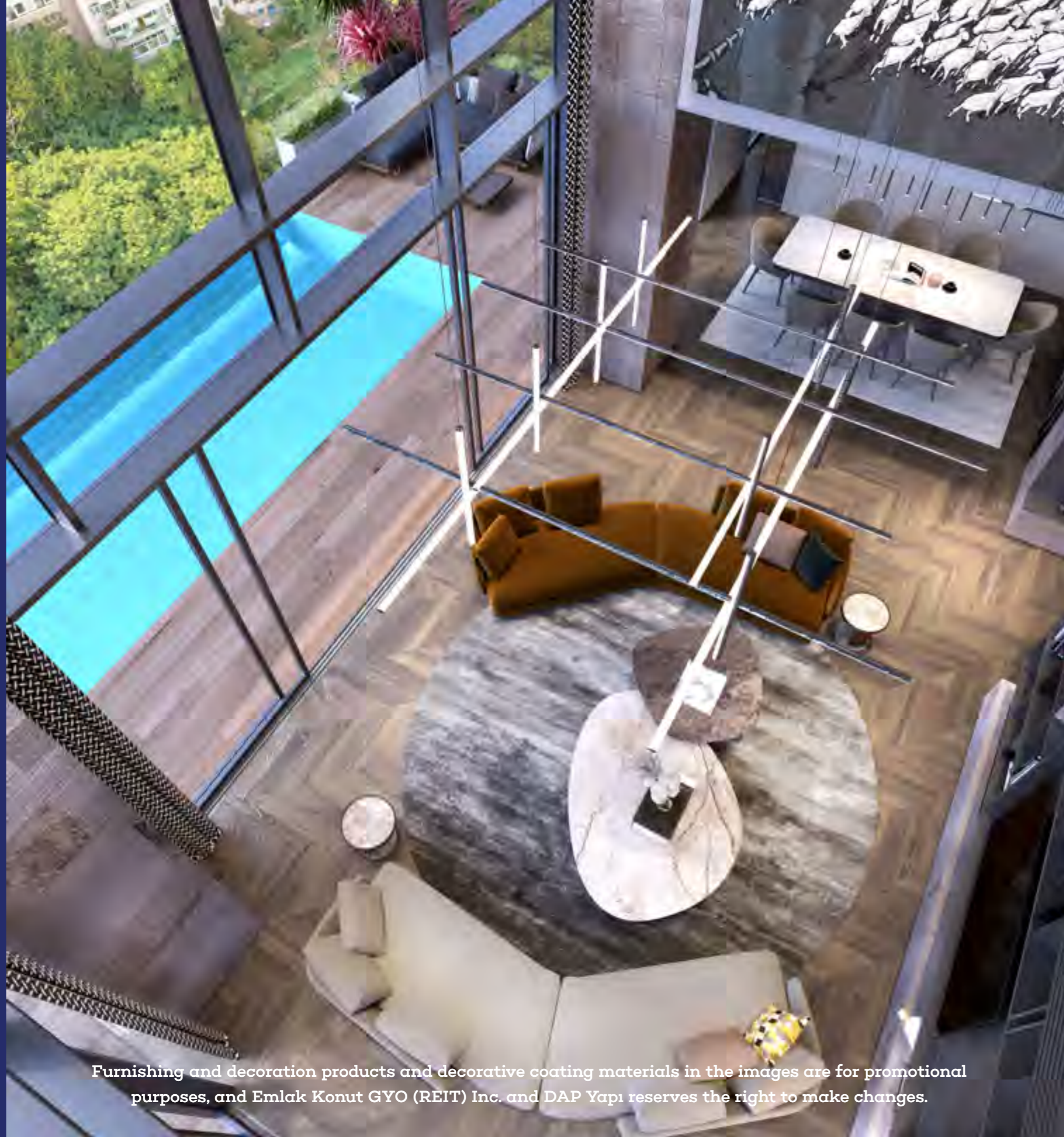
Furnishing and decoration products and decorative coating materials in the images are for promotional purposes, and Emlak Konut GYO (REIT) Inc. and DAP Yapı reserves the right to make changes.